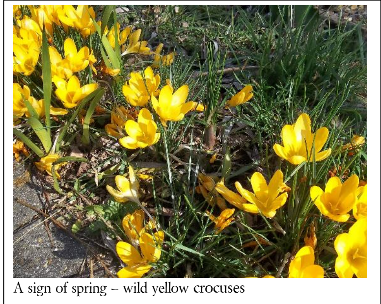
A sign of spring – wild yellow crocuses

The Easter holiday means a lot of different things to different people; to Christians it's the great watershed moment of our faith, as we remember the death and resurrection of Jesus. Symbolically - in the northern hemisphere - it comes at a point in the year when we start to leave behind us thoughts of long winter days and enjoy signs of new life; first shoots and bright spring flowers peak through the hard unturned soil into the fresh and clean air. It's about transition and renaissance, a pivotal and liberating moment, which brings hope and relief, rebirth and warmth.