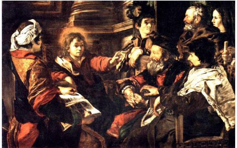
Cristo tra i dottori (c1625) by Giovanni Serodine (1600-1630) Musée du Louvre – Paris

Families can be exasperating at times, and we all know the wry joke, ‘You can choose your friends, but you can’t choose your family.’ But maybe the knowledge that God in his wisdom chose our family members might help us to see each one in a different light.