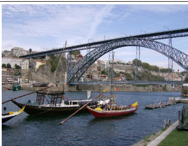
Ponte Dom Luis I - Porto