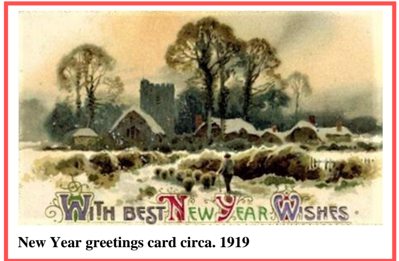
New Year greetings card circa. 1919

We gathered in an informal group, our focus a low table covered in a simple hessian cloth, where the flicker of advent candles, an empty terracotta bowl and a piece of enigmatic artwork stimulated prayerful meditation. We pondered the scripture we'd read together, our Advent prayers and how the artwork spoke to us. Sharing our thoughts and reactions was an illustration of how God responds to each individual need and personality. The feedback was honest and heart-felt, ranging from the mildly sceptical to explosive at times, but no-one remained untouched by their own private meditation.